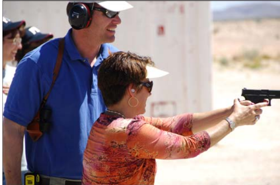
A member of the El Paso Citizens' Academy takes aim during target practice. Citizens' Academy classes generally meet 10 times for three hours each session and are taught by Special Agents in Charge of a field office and by their senior managers and senior agent experts.