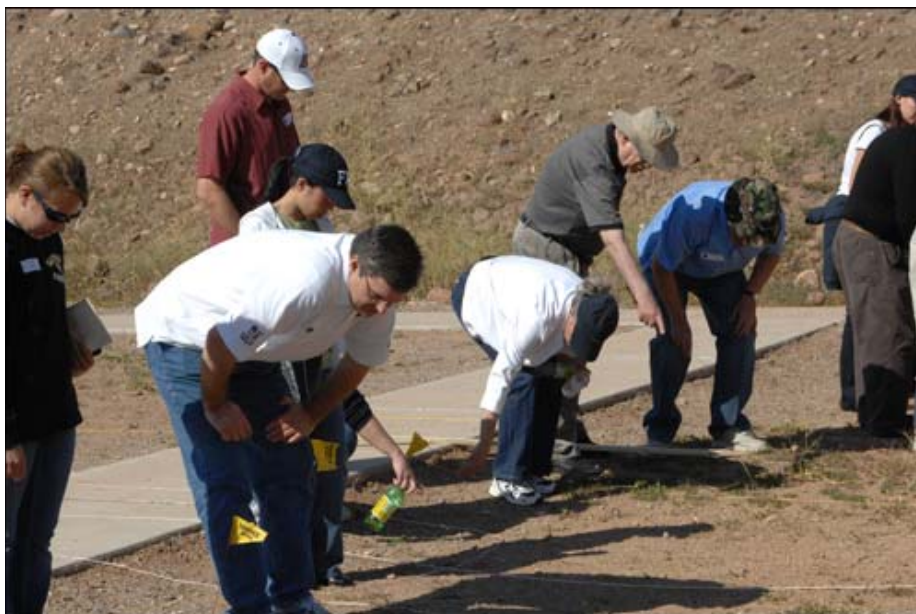
Phoenix Citizens' Academy participants learn the ins and outs of evidence collection

For more than 15 years, our local Citizens' Academies have given some 10,000 community leaders an up-close and personal look at the mission and capabilities of the FBI—and changed plenty of hearts and minds along the way. Why is that so important to us? Because by building stronger partnerships with civic leaders, we are better able to do our jobs. The graduates of our Citizens' Academies enable us stay better attuned to the needs and issues of our communities, are more willing to pick up the phone and call us with information that could help solve or prevent crimes, become "ambassadors" of the FBI who dispel myths and misunderstandings about the Bureau, and often go on to join alumni chapters that work directly with us on all kinds of public safety initiatives.